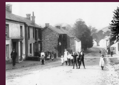
Grampound in about 1900, hardly changed to this day, apart from the outfits and the traffic!

This path roughly follows the course of a stream which eventually meets the River Fal. When you meet the main river, turn left and follow the river path back to Grampound, about 500 yards along the bank, noting the River Authority information signs along the way. With luck you may also see the herons that fish along here.