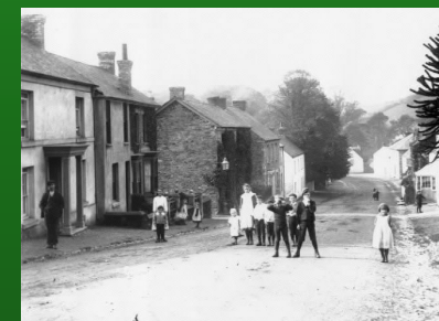
Grampound in about 1900, hardly changed to this day, apart from the outfits and the traffic!