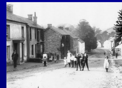
Grampound in about 1900, hardly changed to this day, apart from the outfits and the traffic!